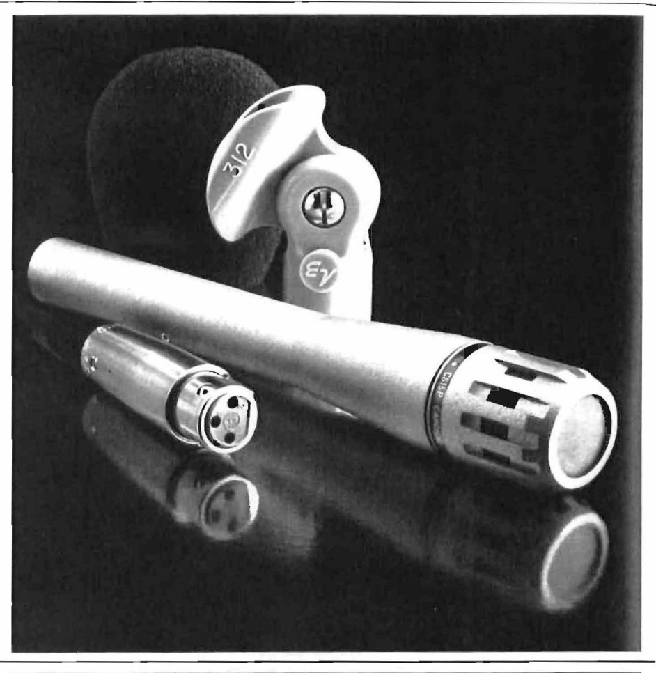
DS35 Single-D Dynamic Cardioid